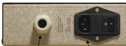
Cable gland for low voltage power output

See the CT-10 Installation Manual for more detailed information about installation including mounting and connecting the CH-103 charger holders.