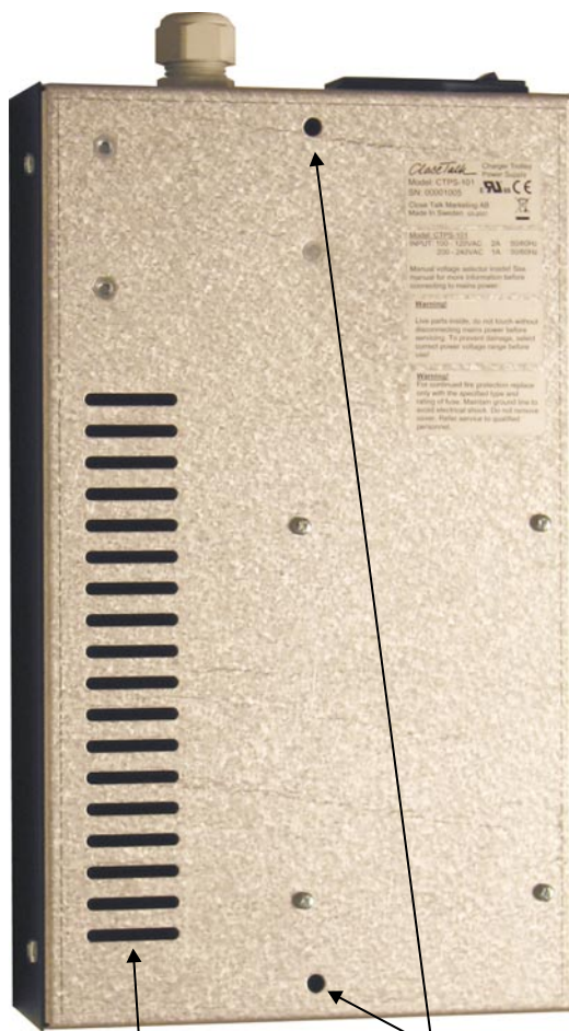
Ventilation inlet, outlet on top cover.